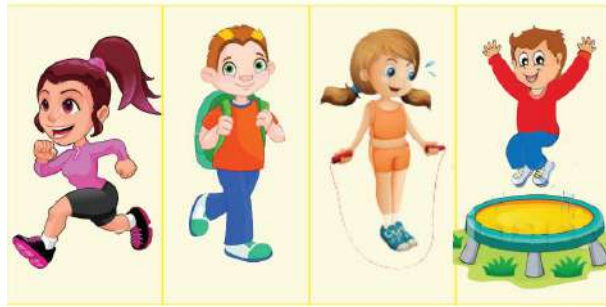
skipping running jumping walking

16 - Match the pictures with the actions. (2 Marks)